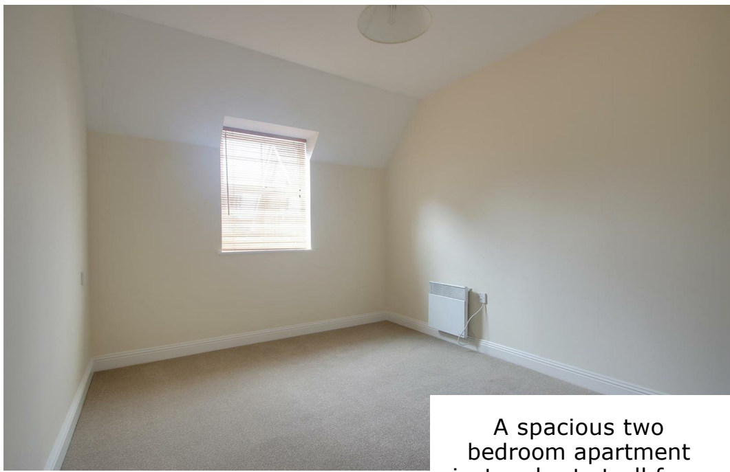
A spacious two bedroom apartment just a short stroll from the High street.